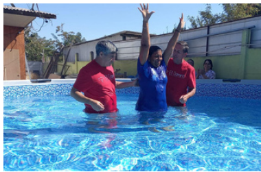
The joy of a new life in Christ, displayed by one of the women baptized on Easter in Santiago.

What a month it has been to declare the glory of the Lord and praise His marvelous works! While we had the blessing of celebrating Easter with our home church in Springfield, Missouri, the church in Santiago celebrated Resurrection Sunday with a baptism service. Ten people made this public declaration of faith! We are so excited for how the Lord is moving and working in Chile and we cannot wait to be a part of it!