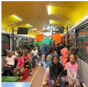
(Left) We really loved participating in the Heaven Train ministry while we were with Capital City Baptist Church in Columbia, SC.

Our prayer is that we will be able to fly to Chile in three months. Please pray for us as we raise the rest of our needed support. The closer we get to Chile the more we have felt the fiery darts of our enemy and the harsher the attacks he wages on our family. We know Satan does not want us going to Chile and sharing the gospel in the stronghold he has established in Santiago. Pray for our safety, pray for our health, and pray for our children as we continue on the path God has laid for us.